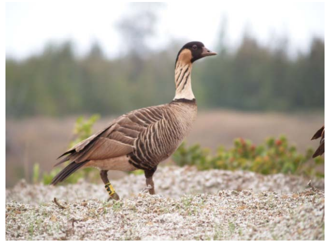
Nene, Hawaiian Goose