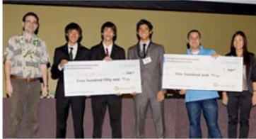
1st Place Aiona Car Sales Hilo High School

2012 HIGH SCHOOL PILOT ENTREPRENEURSHIP PERFORMANCE-BASED ASSESSMENT WINNER