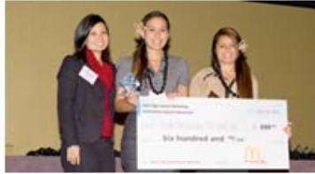
2nd Place Team Missing Polynesia (Missing Polynesia) Kapolei High School