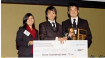
1st Place 4Life Marketers (Cool Roof Hawaii) Moanalua High School