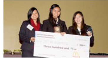
3rd Place Zap! Inc. Associates (Will Kill Pest Control) Hilo High School