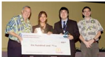
2nd Place Team Ei8ht (Imagin8) Waiakea High School