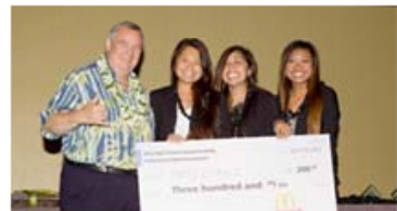
3rd Place Dirty Lickn'z Lahainaluna High School