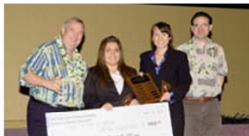
1st Place Dent in the Universe Capital Associates (Cloud Sensei) Moanalua High School