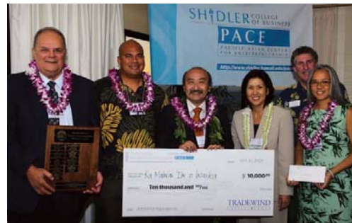
Congratulations to the five teams that advanced to the finals of the 2009 UH Business Plan Competition on April 30 at The Plaza Club. First prize went to Ka Mahi'ai Ihi o Wailea for the creation of the sole commercial venture in the State of Hawai'i for the production and marketing of Hilo Maile.